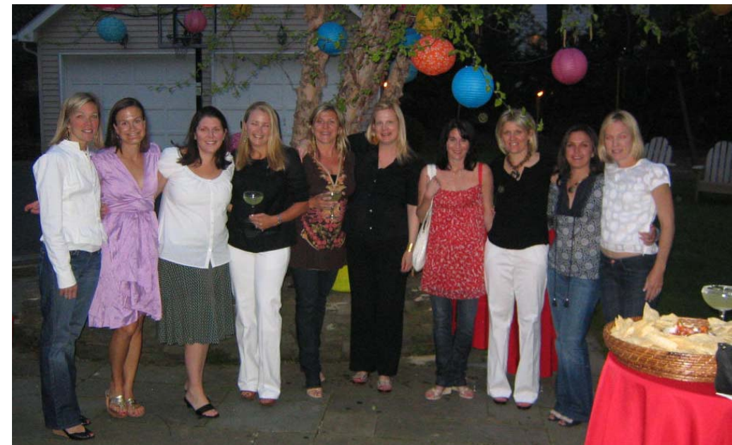
Taking a break from their margaritas, senioritas pose for a group photo.

The Overlook Hospital Auxiliary is a volunteer organization committed to serving the entire hospital community, fostering a compassionate and comforting environment through hands-on volunteering and innovative fundraising. For further information on the Auxiliary, please go to the web site, www.OHAux.org .